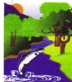
THE DON DISTRICT SALMON FISHERY BOARD