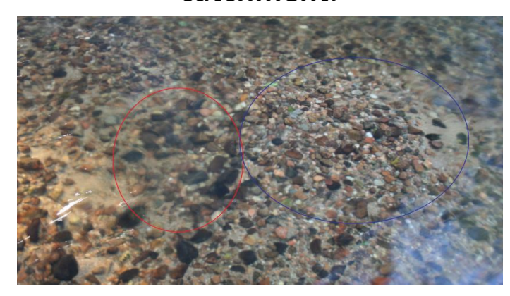
Sea Trout redd in a tributary of the Don, the red circle indicating the depression at top of the redd and the blue circle indicating the cut gravel with eggs underneath.

The Board has begun it's redd counts for this year with support from the Trust. This year the Trust has integrated a programme of mapping all redds, fish cutting redds and dead kelts during the redd counting process. This will enable the Trust to digitally map spawning for this year which will allow comparisons to be made with future season much easier. So far the results are looking promising with a good coverage of redds throughout the catchment, the dry autumn was thought to have restricted the movement of larger salmon in particular but this doesn't seem to be the case, further counts will shed more light on the situation and the Board will be updating you on this as progress continues.