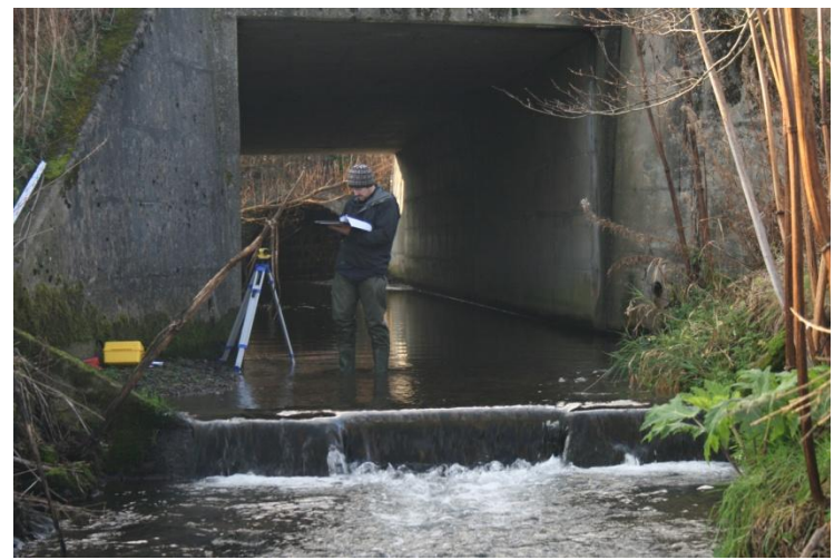
The Biologist assessing a potential obstacle on a Don tributary

The Trust has been invited to be part of a pilot project with our umbrella organisations RAFTS and SEPA to determine the pass-ability of a number of obstacles across the catchment. The purpose of this work is to prioritise the structures so that they can be eased in a manner which is optimal for migratory fish movements.