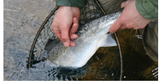
Scale being collected from a salmon in the water using tweezers

Thanks to all those who have contributed to the scale sampling programme this season. Some scales are still to be collected from anglers so please let the biologist know if you have any to return.