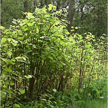
Invasive plants, Giant Hogweed and Japanese Knotweed

To date 27 volunteers have been trained in the use of the safe use of herbicide spraying in or near water, the appropriate licences have been acquired and the spraying is due to begin next spring targeting Giant Hogweed in the upper catchment. Some control has been carried out focusing on isolated patches of Himalayan Balsam in and around Strathdon with the help of some volunteers.