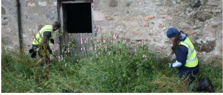
Volunteers 'Pulling' Himalayan balsam adjacent to the River Don

To date 27 volunteers have been trained in the use of the safe use of herbicide spraying in or near water, the appropriate licences have been acquired and the spraying is due to begin next spring targeting Giant Hogweed in the upper catchment. Some control has been carried out focusing on isolated patches of Himalayan Balsam in and around Strathdon with the help of some volunteers.